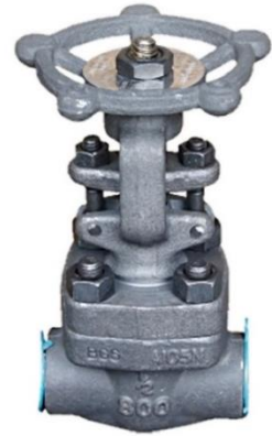
Threaded End A105 Gate Valves 800 PSI