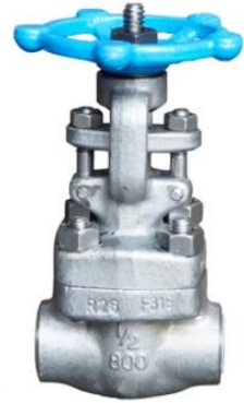
Threaded End SS316 Gate Valves 800 PSI