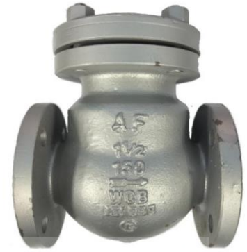
ANSI 150# Cast Steel Flange End Swing Check Valves